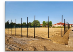
Progress of outdoor court renovation

The Racket Club's outdoor hard courts are in the midst of being rebuilt. Three layers of asphalt courts were uncovered in the demolition work. Pro Cushion surfacing with the blue/green color coating will finish off the courts once the asphalt layer and new fencing are installed. The southeast asphalt court will be releveled, and new color coating applied. A new practice backerboard will be installed within this court for practice play. These courts will be striped for tennis and pickleball play. We are working with tennis court consultant Fred Kolkman, Tennis & Sport Surfaces, LLC. on this project.